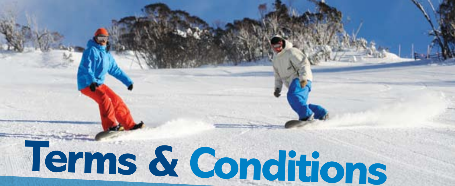
Image - Thredbo